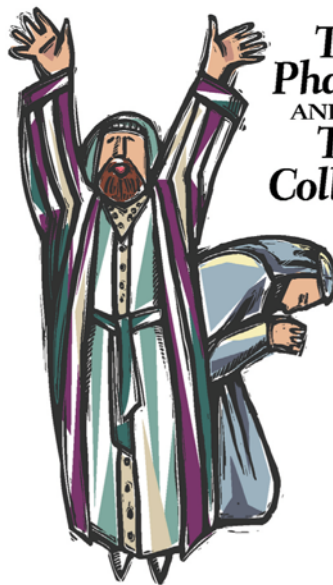
The Pharisee AND THE Tax Collector

However, the tax collector provides a good example for us. He focused only on himself and what he had done wrong, not what others were doing wrong.